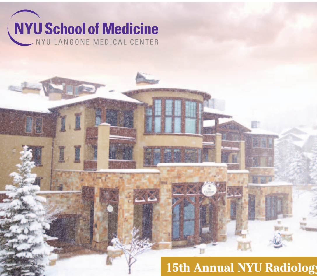
The Chateaux at Silver Lake, Deer Valley, UT